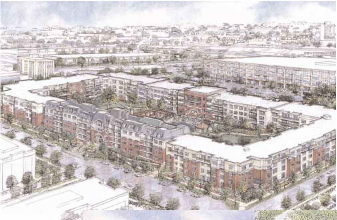
808 Berry Place, Walsh Bishop, Architects